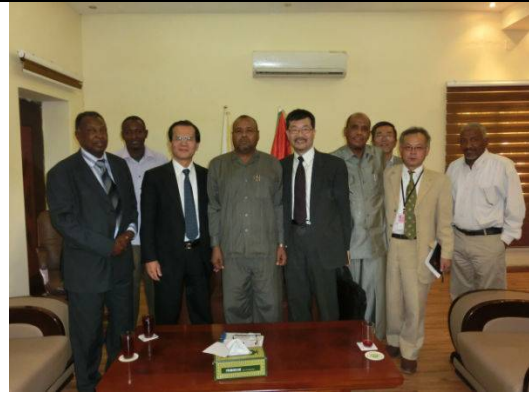
At Governor's Office