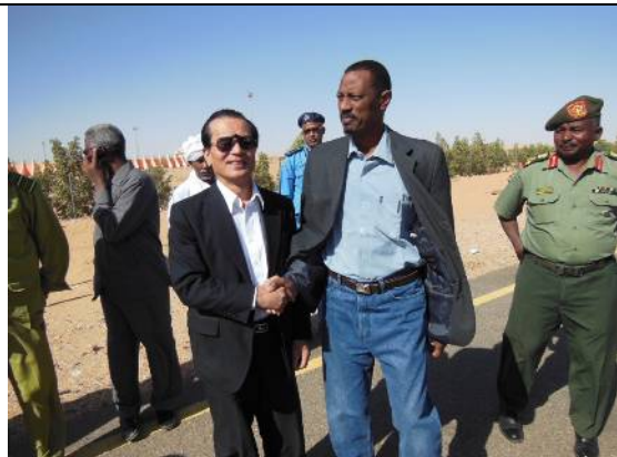
Ambassador and Commissioner of Merowe Locality