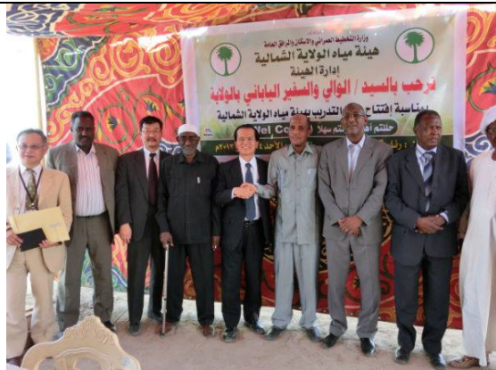
Opening and Handover Ceremony