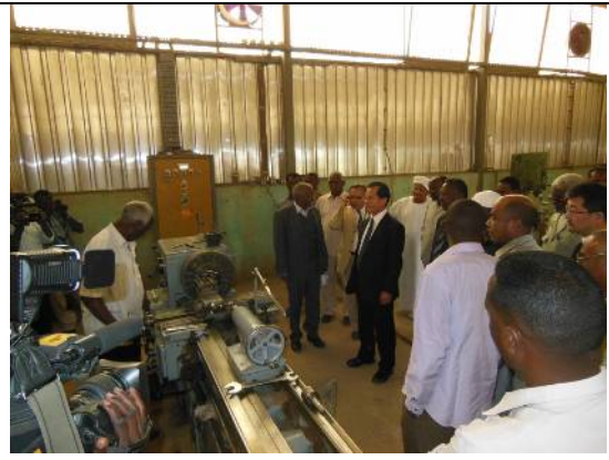
Site visit at Northern State Water Cooperation