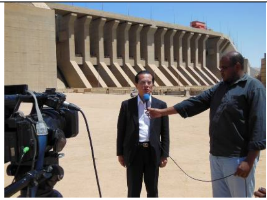
Interview at Merowe Dam