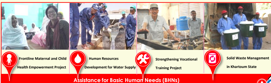
Assistance for Basic Human Needs (BHNs)