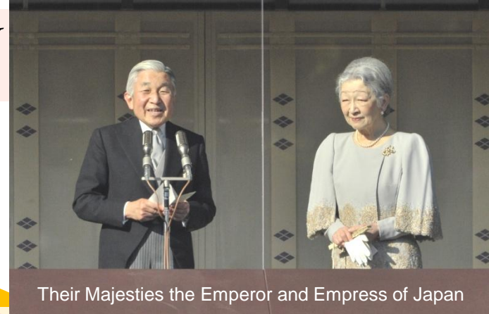
Their Majesties the Emperor and Empress of Japan