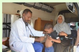
Examine a boy inside Dr. Car