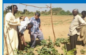
Capacity Development Project for the Provision of Services for Basic Human Needs in Kassala State