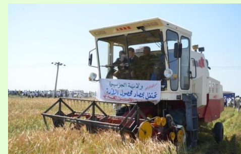
Ambassador riding a Combine Harvester in Gezira

In November, the Embassy of Japan and JICA Sudan Office co-organized "2014 ODA Press Tour" with the aim of providing the firsthand knowledge of Japan's ODA to Sudanese journalists of newspaper and TV. This year we visited Gezira State where Japan's various ODA projects are implemented such as upland rice cultivation and Dr. Car(mobile clinic) projects.